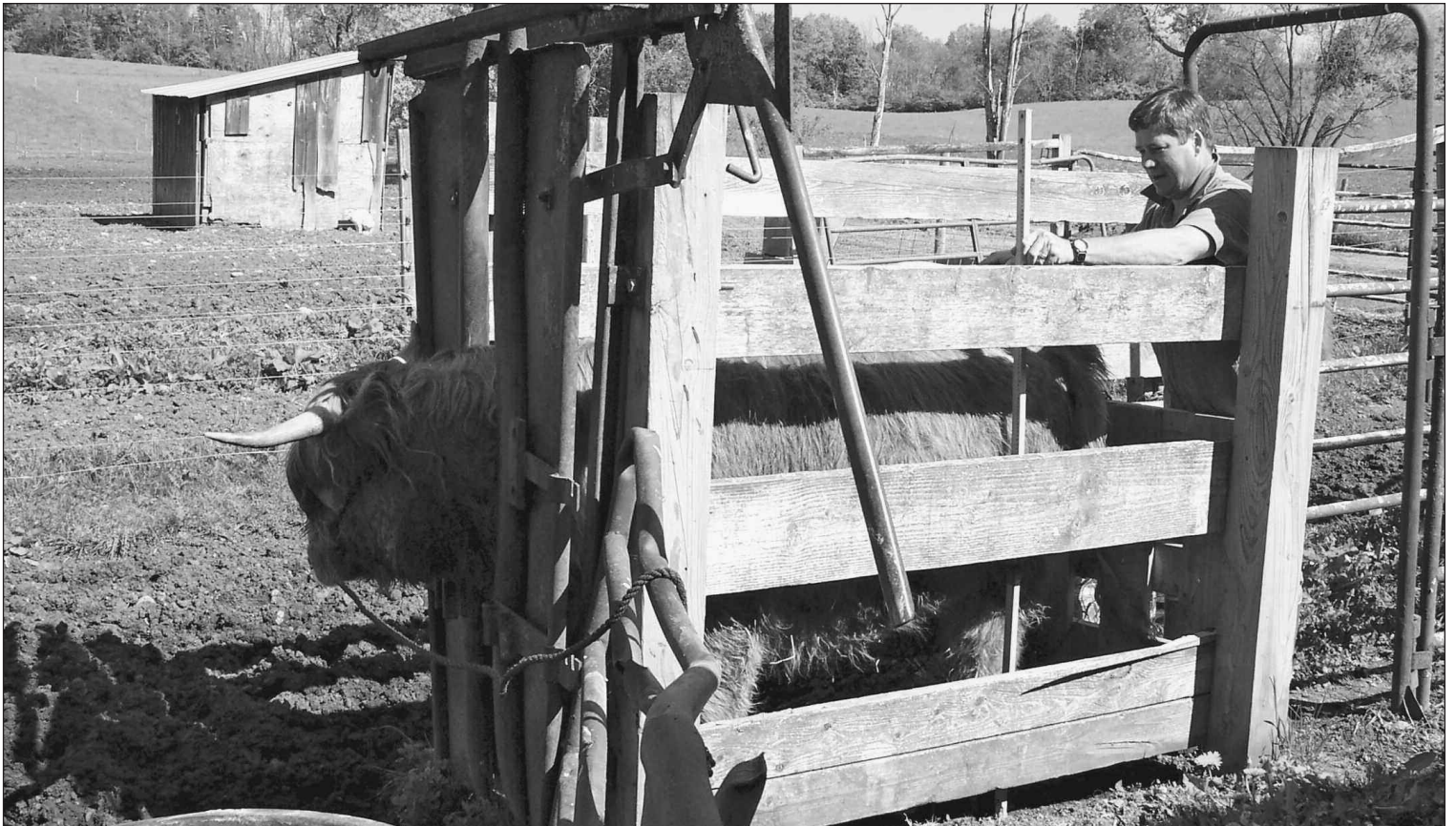
Having good handling facilities is essential for working safely with cattle. Here the animal is restrained in the headgate, the side boards keep it from moving around and a back gate protects the handler from being kicked.

description; hysterical and scared. It did not want to leave the perceived safety of the trailer and turned on my friend. While there was an escape door on the trailer, it was not unlatched, and the slaughterhouse employee who was present apparently didn't have the presence of mind to get to that door in what my friend considered a timely fashion. Fortunately, he was not seriously injured but he certainly could have been. We schedule at least 2 animals for slaughter at the same time for this very reason. They have a companion to keep them comfortable and calm right up until the end. A Judas goat (or cow) would serve a similar purpose in getting a single animal to the abattoir safely and sanely.